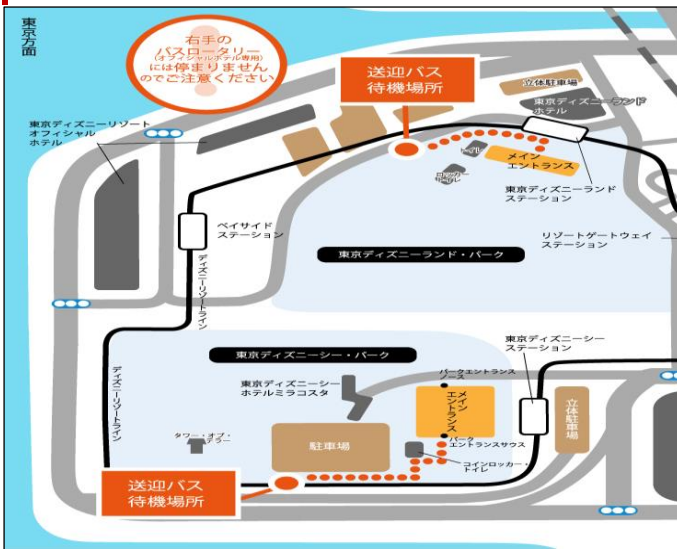
Shuttle Bus Waiting Area for TDL

* The following "Shuttle Bus Waiting Areas" in both parks will be closed in 30 minutes after the Park closes.